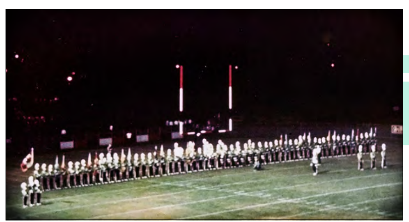
1969: Toronto Optimists On The Line (Nationals)

All the proceedings of the evening would be conducted in an atmosphere of electric tension. La Salle Cadets put on an excellent performance, in front of a hometown crowd. It ranked with anybody and made it evident that the outcome would not become known until the retreat.