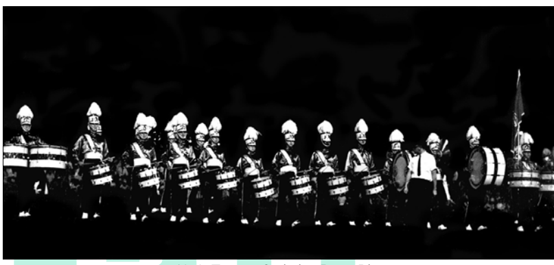
1969: Toronto Optimists Drum Line

Both Corps were extremely nervous, though for different