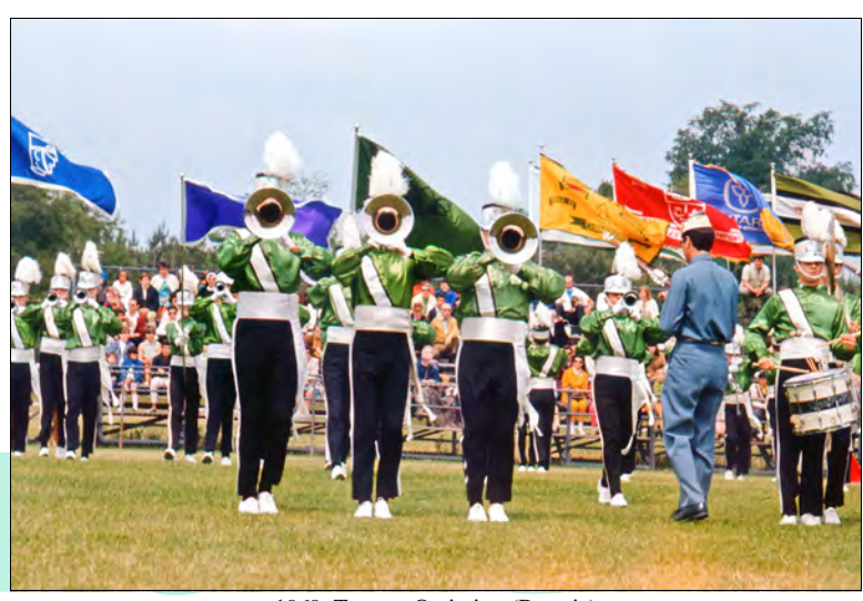
1969: Toronto Optimists (Batavia)

This year, they had switched to a more open style, flashier, but more difficult to execute accurately. On the other side, De La Salle had adopted a more closed style, which was better