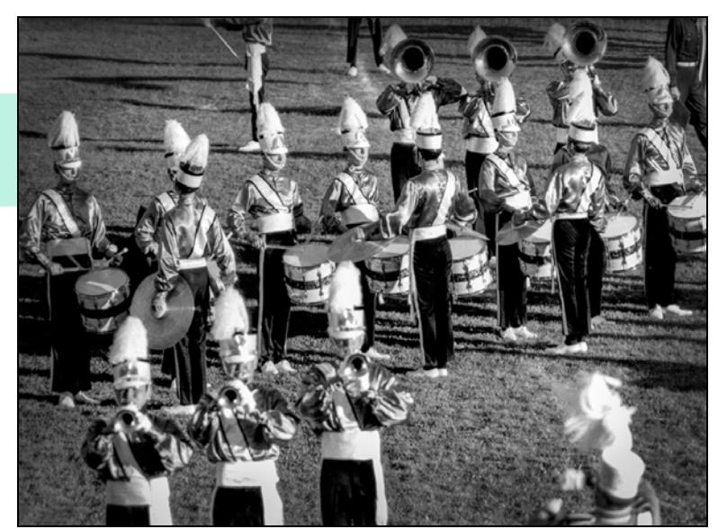
1969: Toronto Optimists

Part of these objectives was to establish a closer working relationship between the Corps itself and the executive.