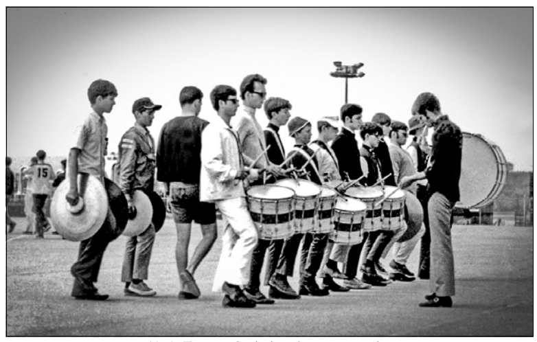
1969: Toronto Optimists drums at practice

The greatest Nationals winning streak ever seen in Drum Corps had finally come to an end. As they stood silently on the field, contemplating their fate, no doubt some members felt a heavy responsibility. They would be known as the ones who lost, broke the record, smeared the streak. In retrospect, none of them should have felt this way. In truth no other drum corps in competitive history has achieved what the Optimists had achieved.