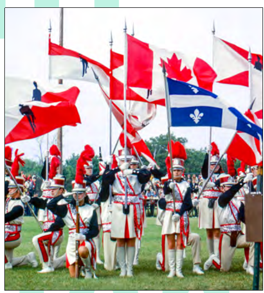
1969: Les Metropolitains

Del was using over thirty people in their colour guard this year and reversed a long-standing trend. The Optimists might follow suit. This fact was an