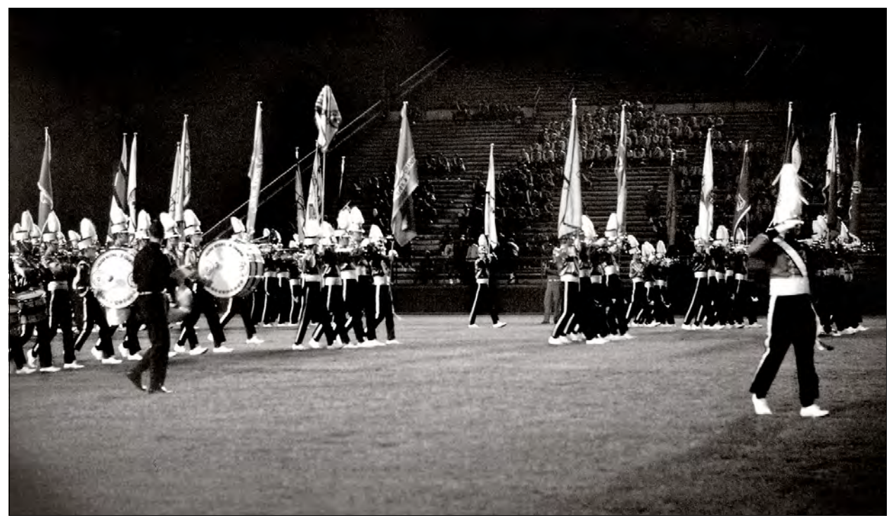
1969: Toronto Optimists (Shrine Contest)

Now, the Corps could move on to a different future.