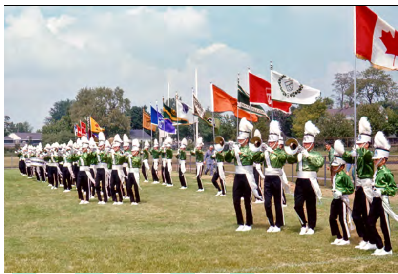
1969: Toronto Optimists (Batavia)

These statements do not belittle what the Optimists had accomplished in the past. That was a phenomenal achievement, not likely to be repeated. Thus far, it has not been. The big winners from this change were, without doubt, the fans. They got more for their money, with nail-biting results and better shows.