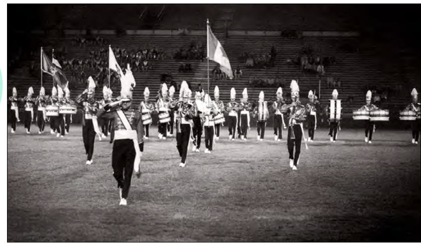
1969: Toronto Optimists (Shriners show)

The four top placings, held by the Americans, ranged in score from Kilties with 80.95, in first, Boston 79.05, second, Blessed Sacrament 78.80, third, and St. Josephs 75.56. Fifth was De La Salle,