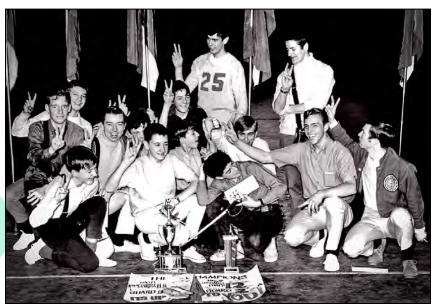
1969: Toronto Optimists Circuit Guard with trophy

For fun and spirit, the Corps held a rally night and party. This was a good thing considering all the work projects now in hand. This year's Ontario Individuals saw the Optimists fare quite well, amid the largest number of entrants yet recorded. Five first places capped a decent collection of placings in various categories. Highest scores were achieved in rifle and horn categories, reflecting quality in both the guard and horn line.