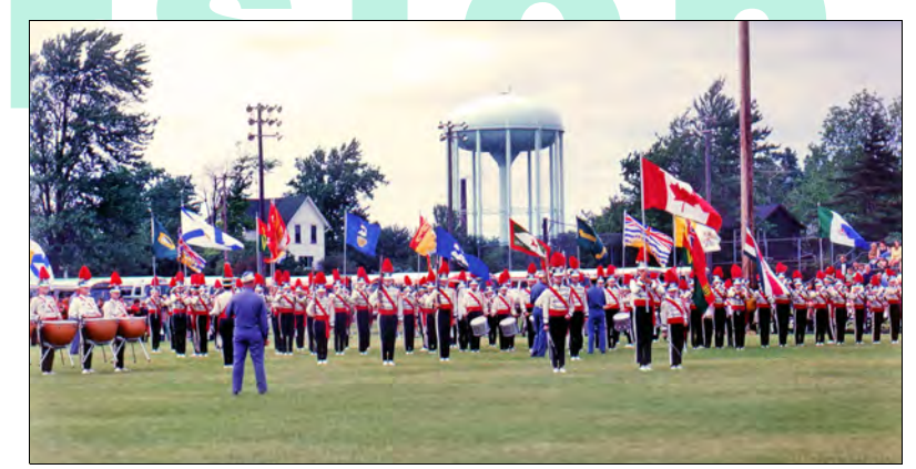
1969: De La Salle (Batavia)

What about the Optimists? Were they now just another Drum Corps? Hardly!