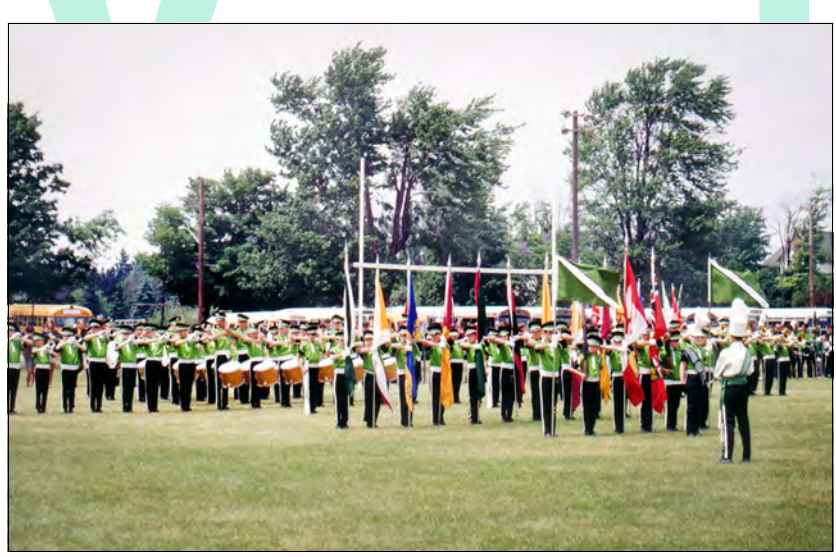
1969: Optimists Cadets in Batavia

Money raised in this fashion was used for items not covered in the Optimist Club budget. Among these were a truck subsidy for gas and upkeep. The Corps now had an equipment truck. They