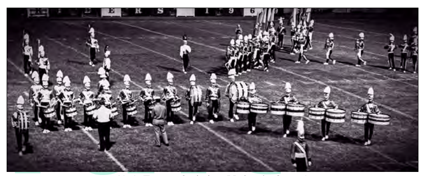
1969: Toronto Optimists (Nationals, Ottawa)

In second place, with a score of 80.80, from Toronto (both corps were from Toronto)